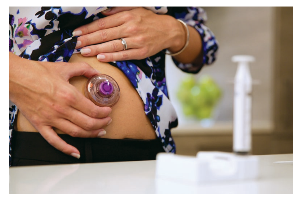
Figure 3: The "3 P's" of Enable Injections: Place the injector onto the skin; Pull the safety tab; Press one button.

a significant role include dose variability across a patient population, ease of use, the need for dose adjustment and whether the drug must be refrigerated or kept at room temperature. Parenteral drug products are typically stored refrigerated at 2-8°C. A decrease in temperature will cause viscosity to increase exponentially. Bringing refrigerated drugs to room temperature can take 30 minutes, an inconvenience for patients. Consequently, there is a need for a delivery device capable of transferring highly viscous product and eliminating waiting time for the drug to rise to room temperature.6 Other enhancements, including simple data capture technology, can be incorporated to monitor compliance and adherence to therapy.