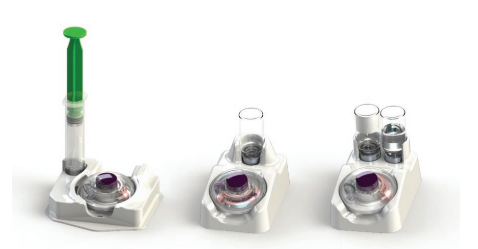
Figure 2: Platform technology that utilises standard vials or syringes and offers automated mixing and reconstitution.