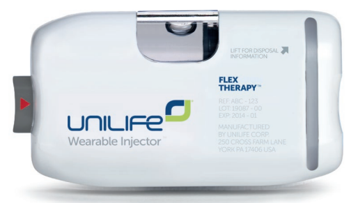
Figure 4: Flex-Therapy wearable injectors are designed to optimise the variable rate delivery of injectable biologics with dose volumes greater than 2 mL.

(Figure 4) has an electromechanical drive system for delayed bolus, variable or intermittent bolus injections, and is designed for use with therapies where the specific delivery rate profile helps to determine clinical outcomes.