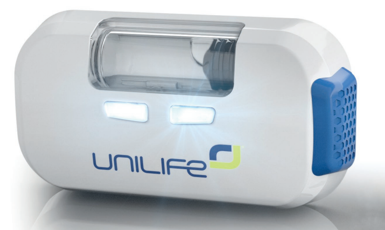
Figure 2: A 1 mL product configuration from Unilife's wearable portfolio designed to enhance biologics constrained by the limitations of conventional hand-held systems.

and Click" (see Figure 1). By comparison, other wearable injector technologies that require loading and assembly with the drug can take up to nine device-related steps or more to initiate dose delivery, significantly increasing preparation times and the risk of user error.