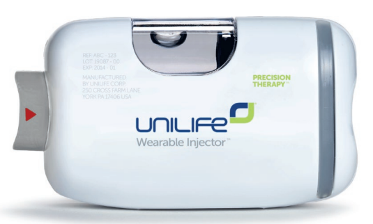
Figure 3: Precision-Therapy wearable injectors are designed to optimise the bolus delivery of injectable biologics with dose volumes greater than 2 mL.

Unilife has created a broad portfolio of wearable injectors for the delivery of injectable biologics with dose volumes between 2 mL and 10 mL. The Precision-Therapy platform (Figure 3) leverages a mechanical drive system for immediate bolus injections, and is designed for use with therapies where the specific dose delivery volume helps to determine clinical outcomes. The Flex-Therapy platform