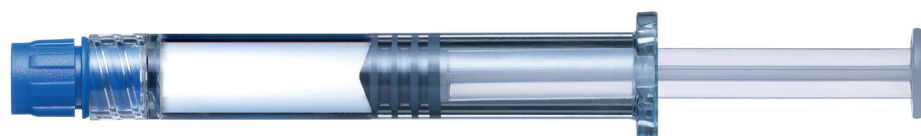
Figure 2: The TopPac® Rigid Cap (TRC) for polymer prefilled syringes.

“Container closure integrity (CCI) is one major concern in the pharma industry. Another one is usability. Our new closure systems deliver in both areas.”