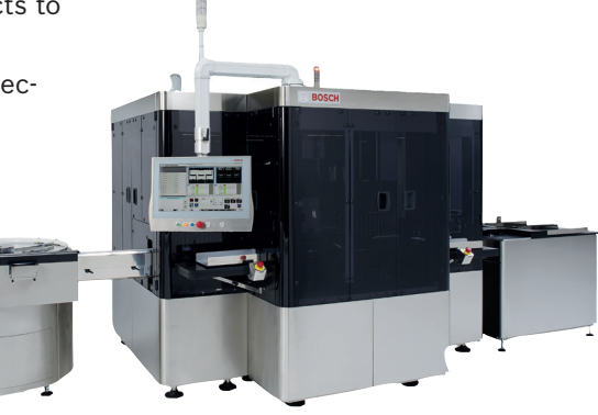
AIM 8000 series

based technology for lyophilized products, cosmetic container defects and liquid fill levels