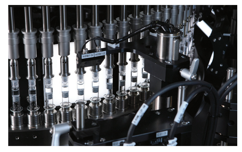
Figure 2: Inspection system with LED lighting.