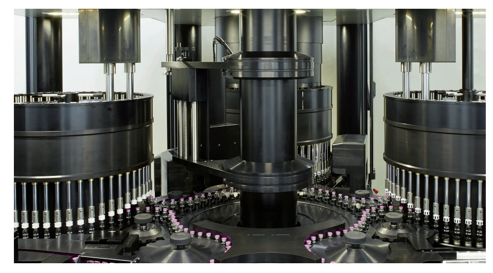
Figure 3: The AIM 8000 series is the most versatile inspection platform allowing rapid customisation to each customer's requirement.