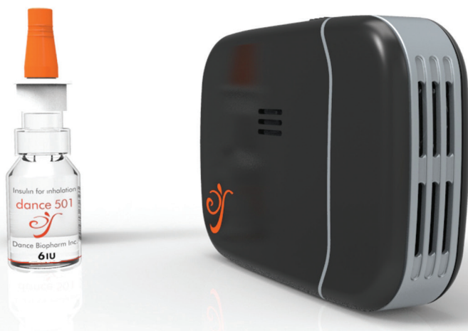
Figure 2: The Dance-501 inhaler from Dance Biopharm is an example of a smaller, smarter inhaler.

In evaluating the landscape of next-generation inhalation devices, there are devices that will accomplish most or all of the above