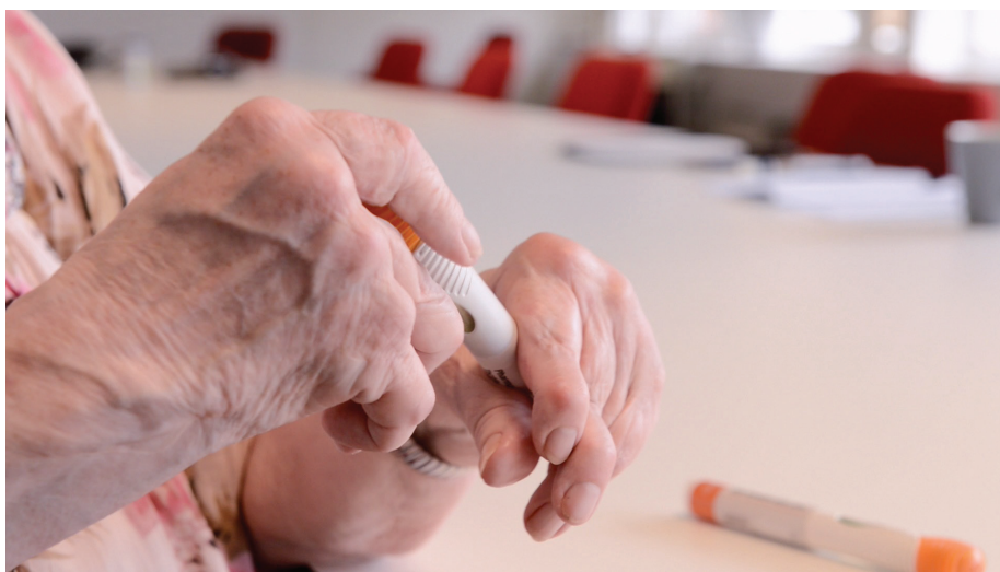
Figure 1: A rheumatoid arthritis patient handles the Amber® Auto Injector and provides positive feedback to SHL design engineers. SHL's Amber™ Auto Injector is a simple ergonomic two-step auto injector that leverages SHL's market-proven Pushclick® technology.

Another example of a user-centric device that has experienced much market success is the Emerade® Auto Injector, an intuitive disposable two-step auto injector designed