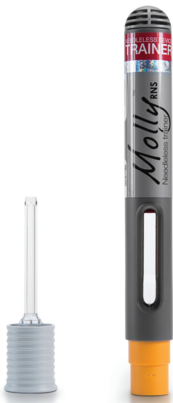
Figure 4: The needleless Molly® trainer helps users simulate the two-step operation of the actual auto injector. The trainer is paired with a reset mechanism in the cap, allowing the device to be used as many times as needed until the user is ready to inject with the real device.

incorporated physical and psychological characteristics minimise user-related risks and enhance user compliance.