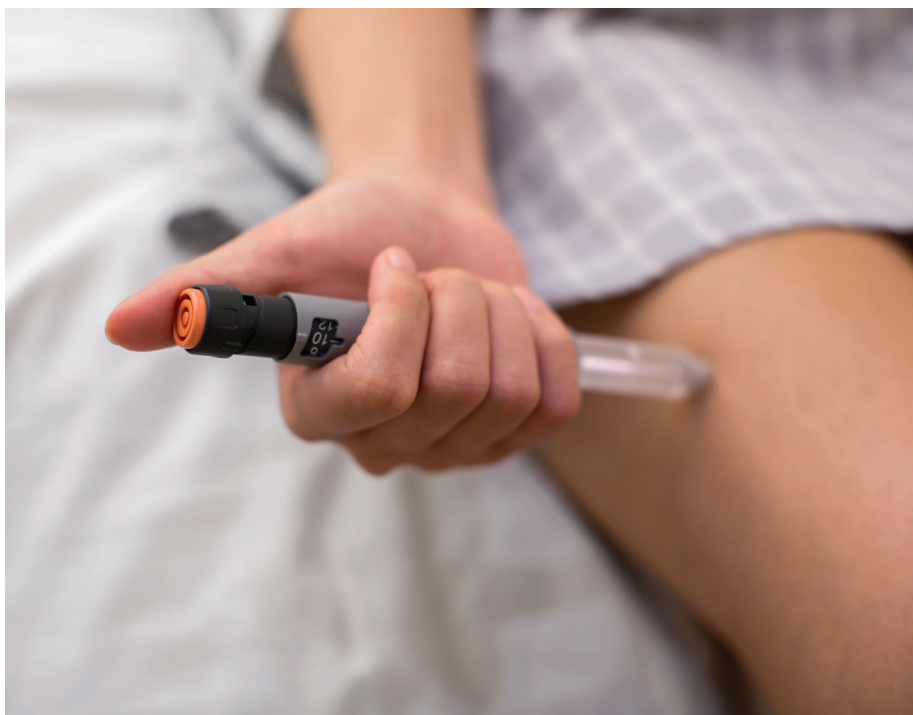
Figure 6: A patient injecting with the Penny™ device in the comfort of their own home.

In an industry where long development cycles and time-consuming product approval processes make trends difficult to recognise, a user-centric approach will always be the basis for the industrial design of auto injectors and pen injectors. In the future, a greater number of unadorned, disposable devices with even more simplified performances will become preferred and stay mainstream. In addition, these devices could potentially have the ability to connect to smart communication systems, for improved compliance and potentially reducing costs.