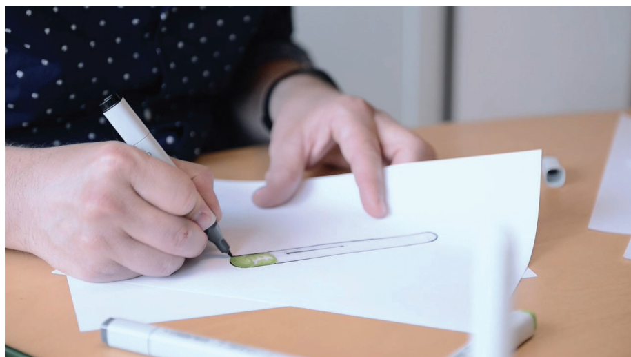
Figure 2: An SHL Industrial Designer sketches a conceptual design of an auto injector.

Other essential considerations include storage of the device, expected delivery timelines and design requirements, such as