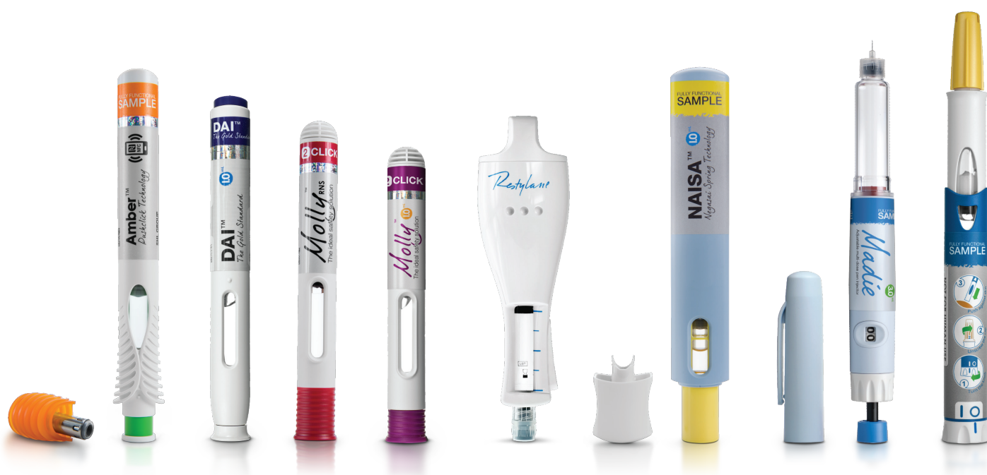
Figure 7: SHL's range of auto injector and pen injector solutions that can accommodate changing injection needs such as higher viscosity, larger volumes, and more.

SHL offers a range of auto injector and pen injector solutions (Figure 7) that can accommodate changing injection needs such as higher viscosity, larger volumes, and more.