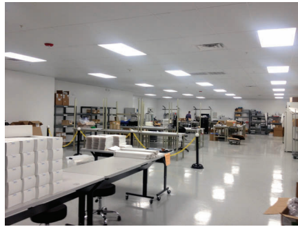
Figure 2: Fully equipped US manufacturing facilities are already in place.