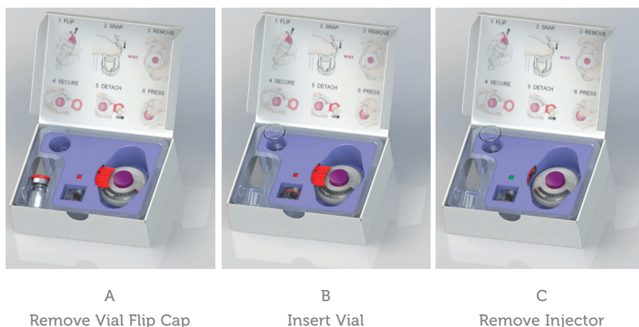
Figure 3: Drug transfer process: three simple patient steps.

Figure 3a) the patient sees inside: on the left, a standard vial or cartridge containing their medication; and to the right, the injector device (roughly the size of an “Oreo” biscuit – just over 4cm across) in a plastic housing. One-word instructions with simple graphic illustrations are printed on the inside of the lid. The three simple patient steps for drug transfer are shown in Figure 3a-c.