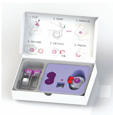
Figure 4: The Enable Injector in dual-vial configuration requires no additional patient steps.

The Enable Injection device can be configured in a dual-vial format too, providing automated mixing of two vials of up to 10 ml each (see Figure 4). The patient is