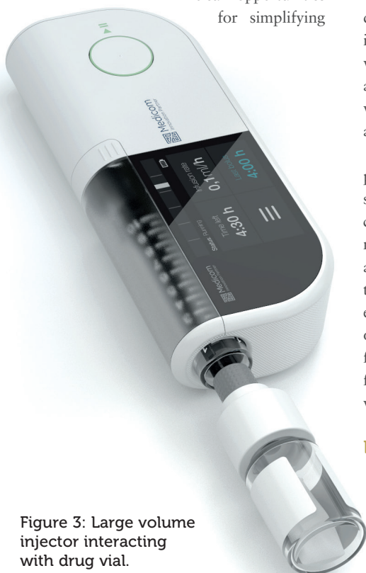
Figure 3: Large volume injector interacting with drug vial.

Moving the administration procedure to the home-setting, there exist clear opportunities for simplifying