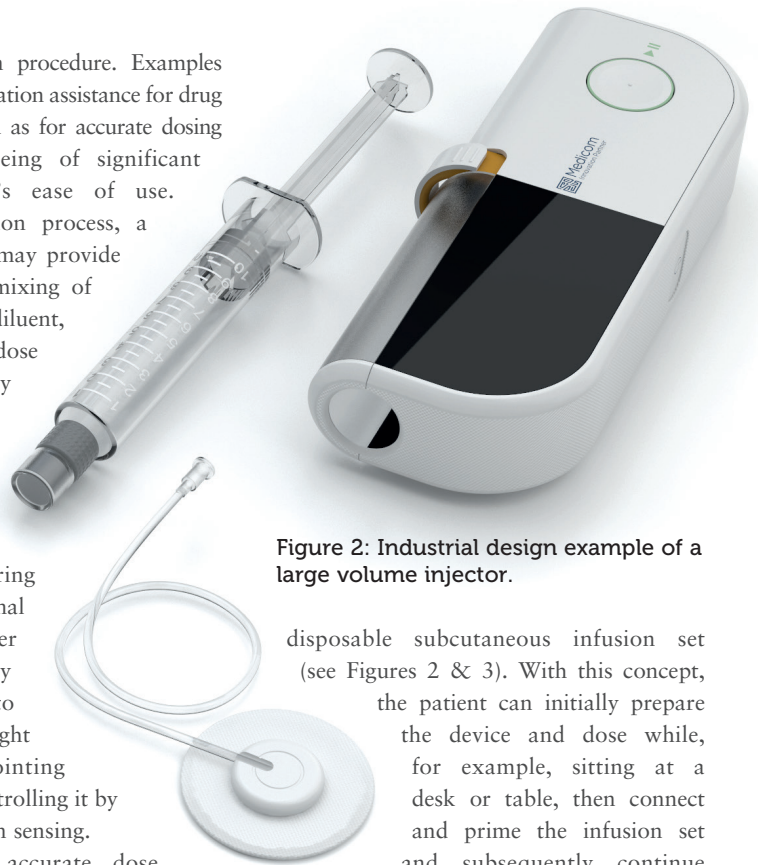
Figure 2: Industrial design example of a large volume injector.

The device concept supporting all of the previously mentioned requirements takes the shape of a re-usable miniature syringe pump equipped with a standard