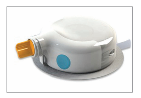
Figure 1: PatchPump configured for external subcutaneous infusion set.

PatchPump is highly customisable, and is intended to deliver volumes up to 10 ml, over a period of minutes or a number of days depending on the delivery needs of the particular therapy and disease state.