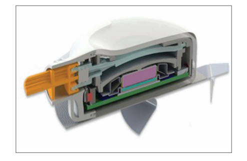
Figure 4: Cross-sectional view showing the components layered within the PatchPump.

It is expected that the PatchPump will usually be positioned on the patient's