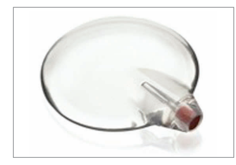
Figure 6: The primary drug container comprises a flexible multi-laminate blister heat-sealed to a rigid base plate, with integrated filling/discharge channel, sealed with a butyl rubber septum.