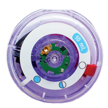
Figure 1: The Enable Smart Device with the button cover in place (top) and the button cover removed showing the chip (bottom).

three key pieces of information about the operation of the drug delivery system: