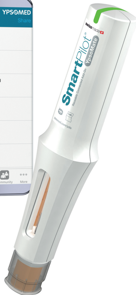
Figure 1: SmartPilot for Ypsomate (right) is a reusable smart add-on, transforming the two-step auto-injector Ypsomate into a fully connected combination product. Advanced sensing capabilities to track device usage and guide patients through the injection process are at the heart of effective adherence monitoring. Relevant injection data is then transmitted to a gateway, such as a hub or mobile app (left), to be made available to clinical trial sites.

SmartPilot for Ypsomate, a reusable add-on that transforms the proven and unchanged two-step auto-injector platform into a fully connected smart product system (Figure 1).