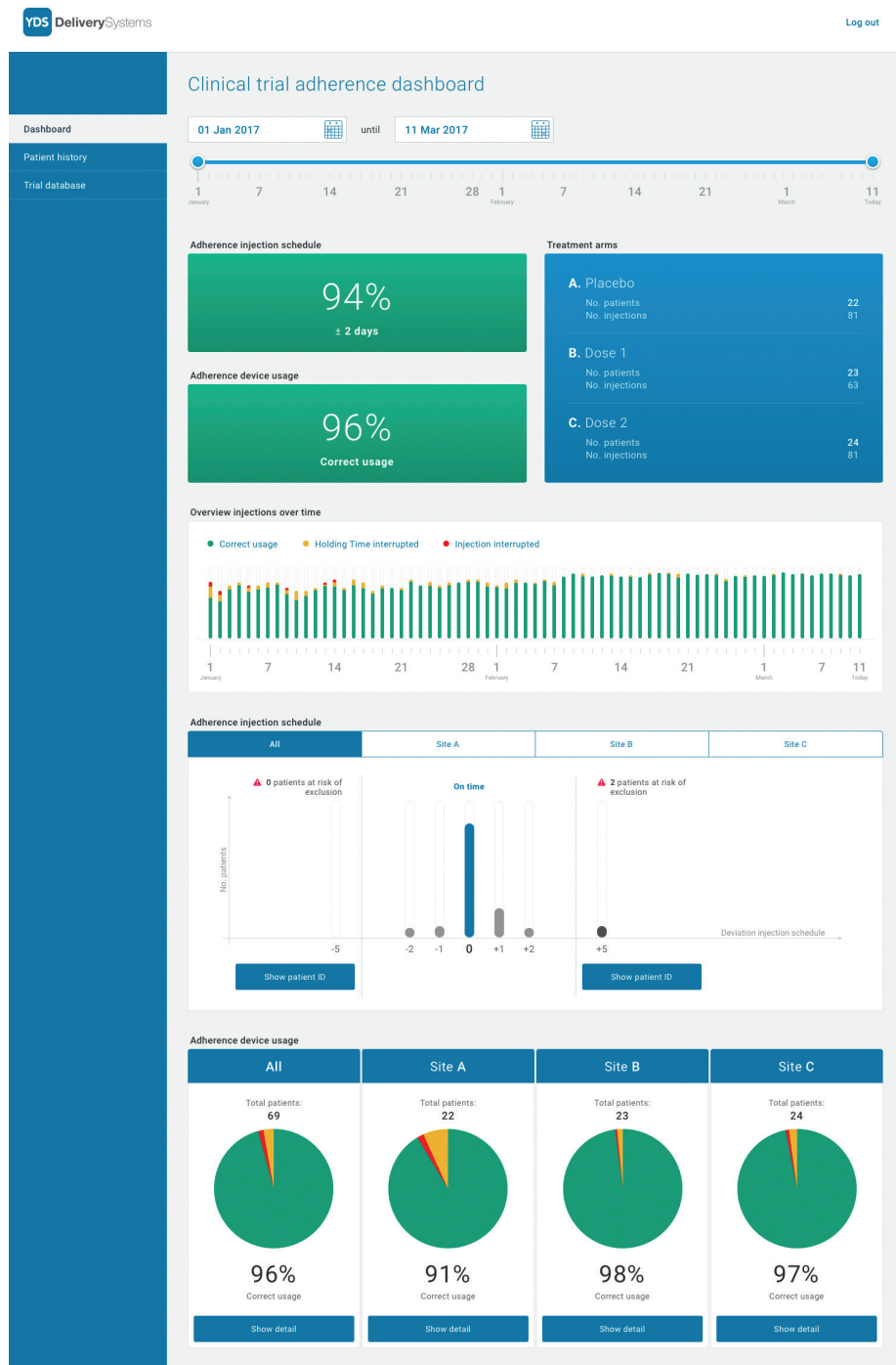
Figure 2: The clinical trial adherence monitoring dashboard sheds light on the two critical dimensions of adherence monitoring throughout clinical trials: injection schedule, as per study protocol, and correct dose administration. The summary report enables real-time monitoring of adherence patterns and, for instance, allows swift action to be taken if handling errors accumulate at certain clinical trial sites.

The soaring costs in designing, implementing, and monitoring clinical trials point to a clear need for a fresh approach. New designs are required that minimise administrative tasks at trial sites and reduce the burden of participation on patients. Here, I described how such innovative, patient-centric trial designs can be enabled by advanced adherence tracking