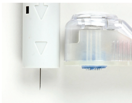
Figure 2: Left – pen injector with single needle, Right – 3M™ Hollow Microstructured Transdermal System with hollow microneedles.

the skin. 3M™ Hollow Microstructured Transdermal System accommodates a wide range of drug amounts (up to 2 mL) and molecule types, as long as stability in liquid form is maintained. This system combines patient-friendly, passive transdermal delivery with the versatility of parenteral syringe injections. For comparison, Figure 2 shows both a pen injector and 3M Hollow Microstructured Transdermal System.