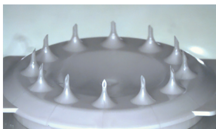
Figure 3: 3M Hollow Microstructured Transdermal System, pPolymer microneedle array with 12 hollow microneedles, each approximately 1500 µm.

3M Hollow Microstructured Transdermal System is designed for intradermal delivery of liquid formulations, including biologics, such as proteins and peptides, in addition to small molecules. Hollow microneedles have the flexibility to deliver up to 2 mL of high value biologic formulations. 1,2,3 This system also provides relatively fast delivery of a high volume of a liquid drug formulation. 3M Hollow Microstructured Transdermal System array is a 1 cm 2 polymeric disk composed of hollow microneedles with a sterile flow path connected to a conventional glass cartridge. During application, the microneedles are inserted into the skin penetrating the stratum corneum and epidermis, and creating direct access to the dermis. This hollow microneedle array, as demonstrated in Figure 3, is made from medical grade polymer with 12 microneedles 1500 µm tall. Delivery of the formulation through hollow