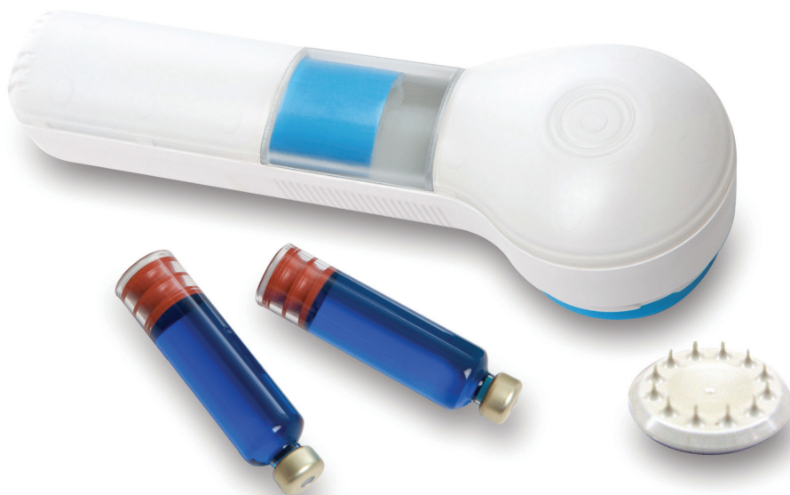
Figure 5: The 3M Hollow Microstructure Transdermal System device.

low regulatory requirements for patient-centric design and self-administration considerations.