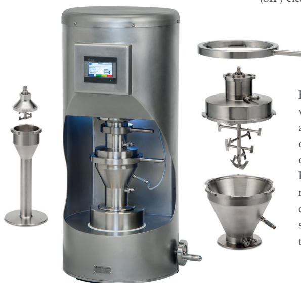
Figure 2: A high-shear batch mixer with exchangeable product bowls, designed for blending DPI formulations.

Conical high-shear mixers are capable of blending the powder fractions of the formulation and fine-tuning the appropriate energy input. Offering distinct production advantages, plus multiple handling and contamination avoidance benefits, conical high-shear mixers can be used for various blending stages, including pre-mixing both lactose blends and API/carrier blends (Figure 2). Besides these blending processes, coating processes can be run as well, for instance, the coating of lactose with magnesium stearate.