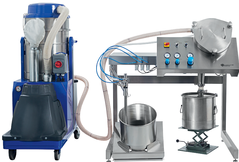
Figure 1: The spiral jet mill micronises particles by accelerating them in high gas flow causing them to collide and fragment.

advised. Keeping this in mind, the blending sequence of coarse and fine lactose with API, as well as the cohesive/adhesive balance, needs to be observed for the selection and tuning of the mixing process.