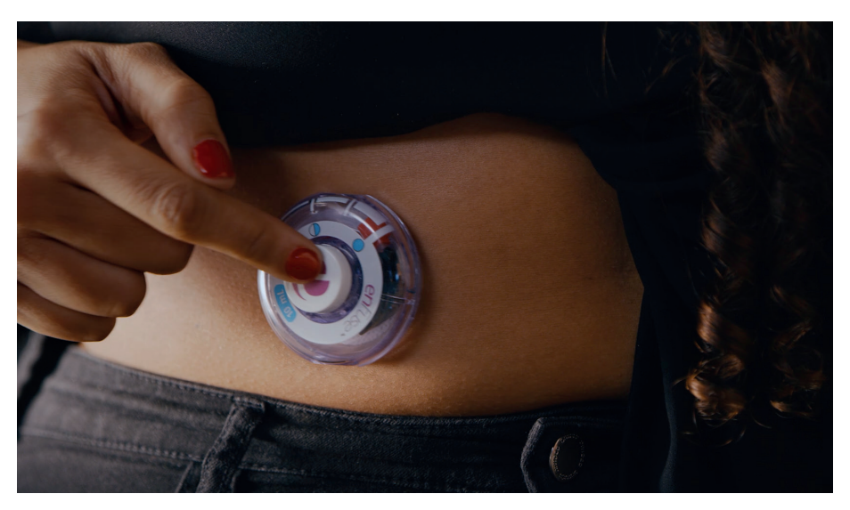
Figure 3: enFuse is small, convenient and comfortable.

Flex's singular, rigorous quality system, conditioning know-how and large-scale manufacturing capabilities made the company an ideal partner to address manufacturing complexity and scalability. Their collaboration and joint engagement to establish material handling, pre-control of critical variable signals and manufacturing