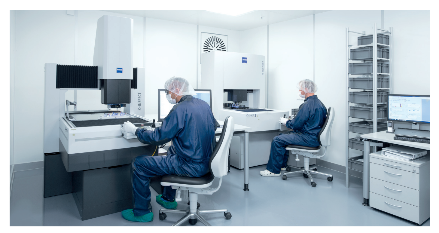
Figure 5: Small batch production includes its own measurement lab.

small batches may be required as clinical samples, development samples or stability batches. With its TCCs, Gerresheimer offers customers its own production systems for this task, which are capable of quick and uncomplicated production of development samples, clinical samples or small series at any point in the project (Figure 5). These facilities include the aforementioned Class 8 cleanroom and some of the injection moulding machines have integrated laminar flow covers to create a Class 7 cleanroom environment in the injection molding area. Project-specific assembly units and specific measuring technologies complete the equipment.