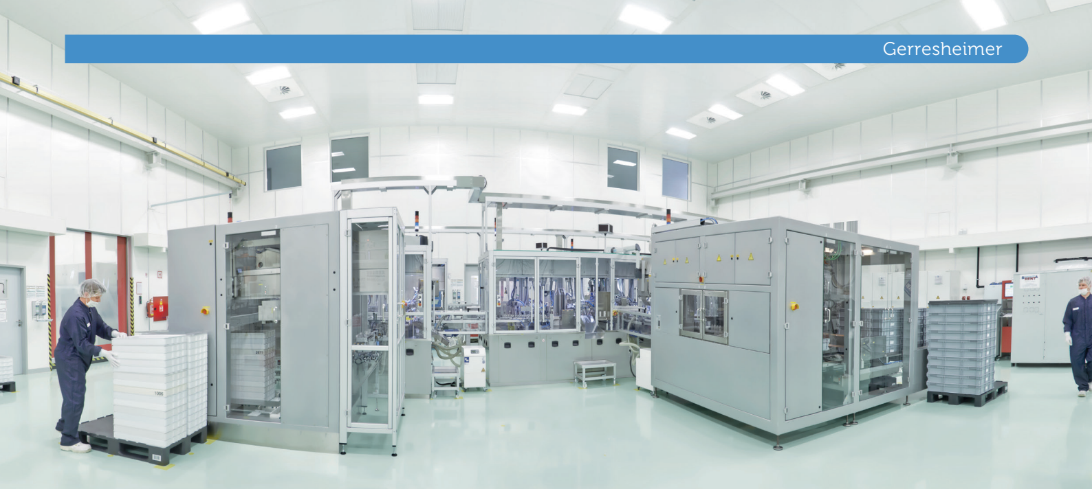
Figure 4: Fully automatic assembly line in an ISO 14644-1 Class 8 cleanroom.