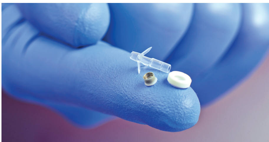
Figure 2: Combination product components, such as these various cardiac pacing components to be loaded with a steroid, are very high value products.

To comply with the additional pharmaceutical requirements, ProMed enhanced its pharma QMS to ensure that drug components and drug product containers are received using approved in-house procedures. Where cleanliness is a requirement, ProMed ensures cleaning of the containers and components takes place and that containers are closed and only opened in environmentally controlled areas to prevent the introduction of contaminants into the products or components.