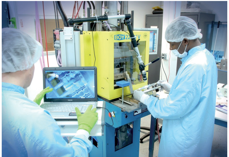
Figure 1: A ProMed Pharma production floor.

As each new manufacturing facility is brought online, ProMed performs design qualification (DQ) to ensure the cleanroom suite has been built to both its and its customer’s specifications. Once the facility has been initially qualified, an environmental monitoring programme is established. The new cleanroom suite is thoroughly cleaned, after which initial testing includes two three consecutive day periods, first with no operators present (static testing), second with operators present (dynamic testing). The airborne viable micro-organism, surface micro-organism and non-viable particulate