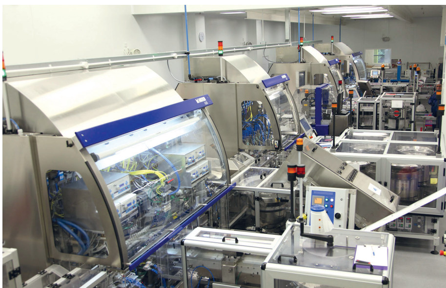
Figure 1: High-performance automatic assembly and test systems.

Providers of automation solutions should be involved from the very beginning of product development. As a fully integrated project partner, we often learn all about the process at the same time as our customer. We always have a sound grasp of the risks involved and, through constant communication, we are able to anticipate future changes