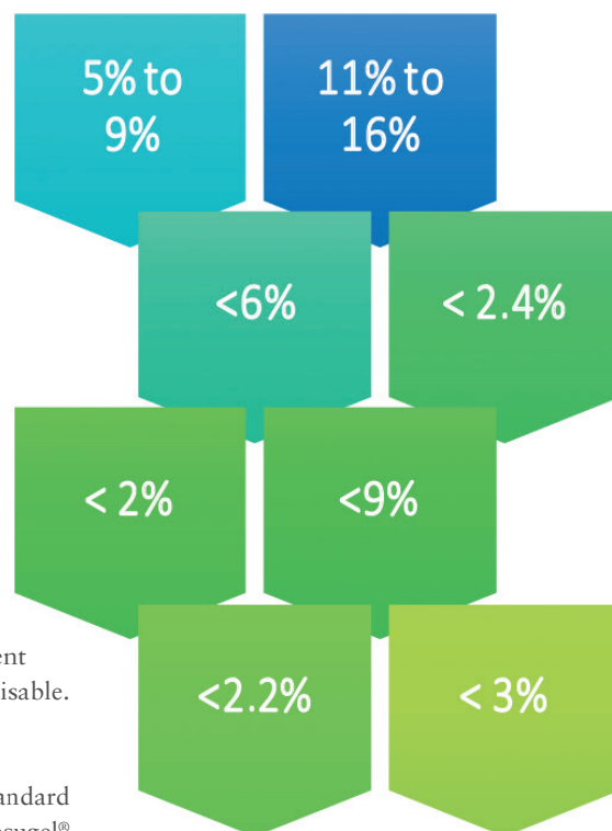
Figure 2: Zephyr™ offers LOD range customisation.

Controlling water content is a particular consideration for many due to the trend towards hygroscopic formulations. Often, capsule loss on drying (LOD) has to be adapted to specific formulation filling properties and stability requirements. Water