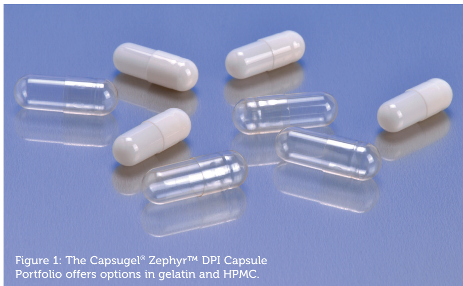
Figure 1: The Capsugel® Zephyr™ DPI Capsule Portfolio offers options in gelatin and HPMC.

The capsule's structural integrity is of paramount importance. First, the capsule must withstand sudden piercing without shattering. Second, the capsule must be sufficiently robust to take this blow without being crushed – thus preventing distortion or other factors that would inhibit the full dispersion of the capsule's entire contents. Structural integrity is therefore a key consideration for developers looking to ensure downstream patient centricity and support patient compliance efforts with their products.