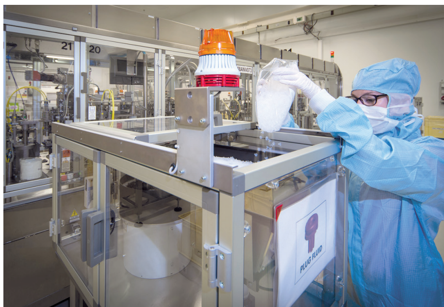
Figure 4: Nemera's headquarters in La Verpillière, France, has doubled its capacity to produce the Novelia ® preservative-free multidose eyedropper.

To serve customers in supporting patient needs, Nemera has recently extended its manufacturing capabilities and, in doing so, has doubled its capacity to produce the Novelia ® preservative-free multidose eyedropper (Figure 4).