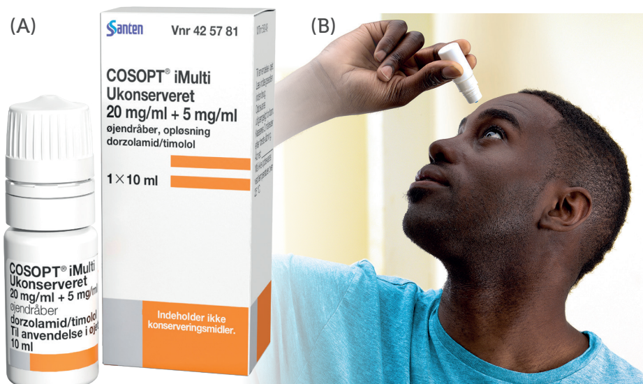
Figure 1: (A) Cosopt iMulti® for the treatment of intraocular pressure in patients with open-angle glaucoma using Novelia®, marketed by Santen (Image courtesy Santen). (B) 76% of patients prefer Novelia® preservative-free multi-dose eyedropper.

Novelia®, Nemera’s preservative-free multidose eyedropper, has over 200 references on the market for prescription