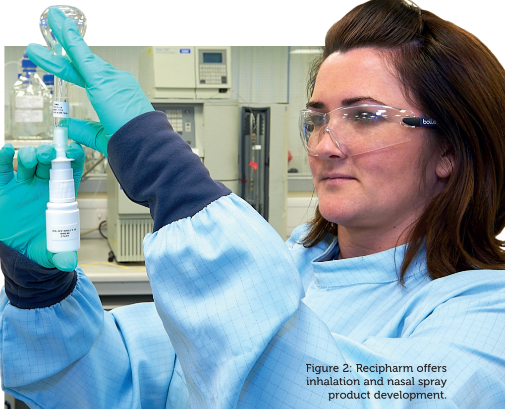
Figure 2: Recipharm offers inhalation and nasal spray product development.

As part of Recipharm’s spray pattern and plume geometry test service, the company offers inhalation and nasal spray product development from initial formulation and process development to registration, commercial batch release and product