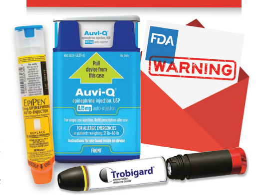
Figure 1: CDMOs have filled gaps in pharma companies' device design knowledge, helping them to avoid device-related complaints, warnings and recalls.