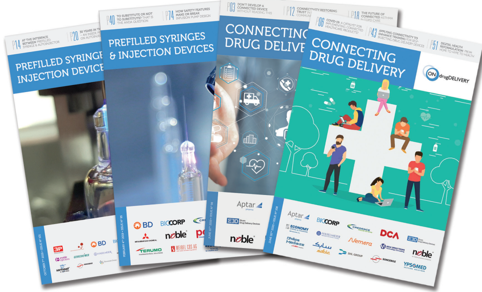
Figure 3: New Directions has published multiple articles in ONdrugDelivery on the subject of telehealth and smart medical devices.

"The literature over the last decade is replete with discussions of the many reasons that patients do not benefit from pharma products, including medication cost, lack of patient training, understanding and support, and the siloed US healthcare system."