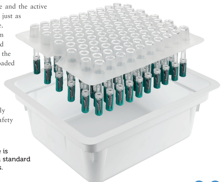
Figure 3: Gx InnoSafe is fully compatible with standard nest-and-tub formats.

Gx InnoSafe provides advantages for pharmaceutical companies in the filling process of RTF syringes. The safety system is