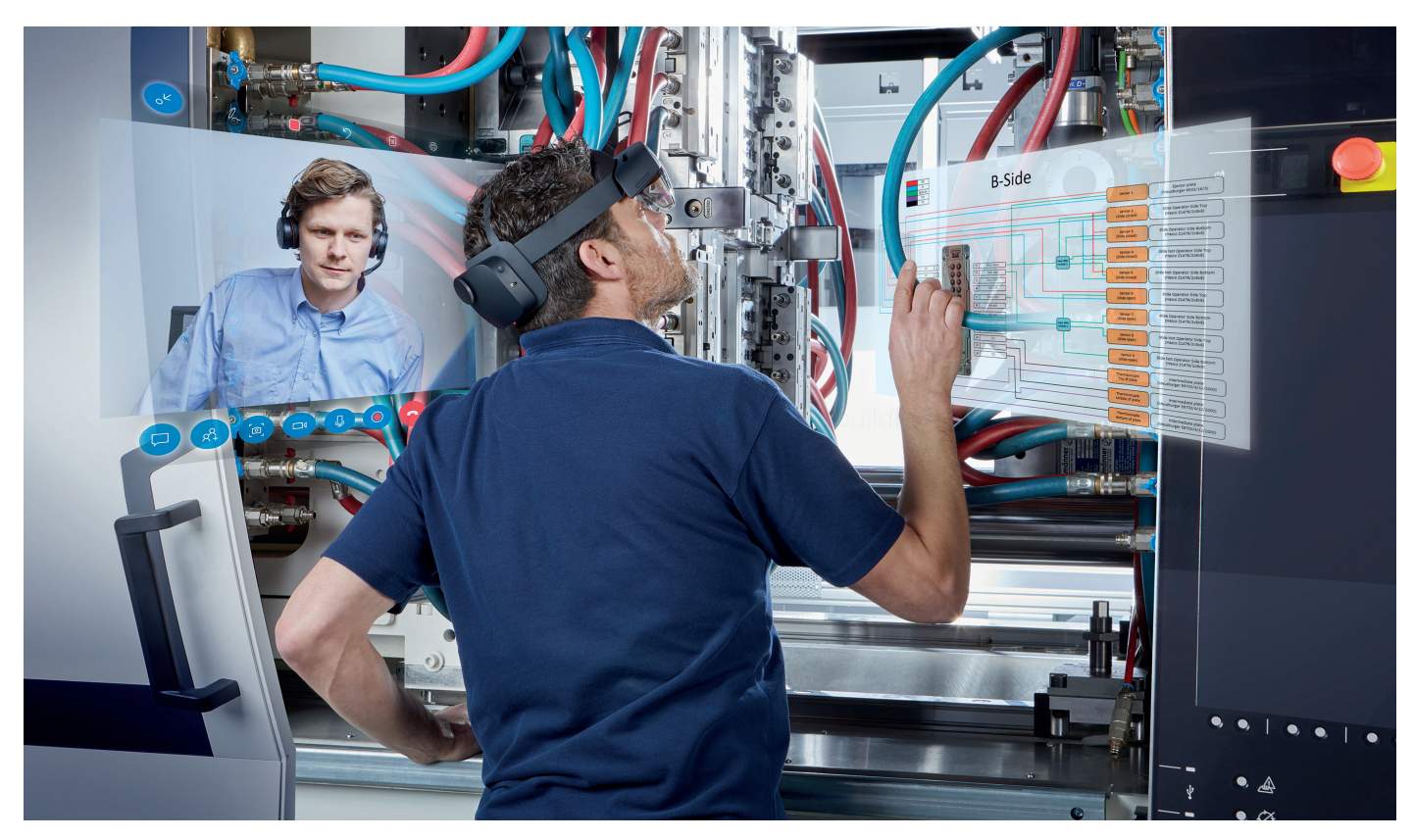
Figure 7: The HoloLens can project interactive holograms such as 3D-mould models, mould manuals and other files.

high-quality video stream and several smart technical solutions. Of course, a big reason to start offering this service was to speed up the validation process for customers. But it is also a great way to reduce \mathrm{CO}_2 emissions (Figure 6).