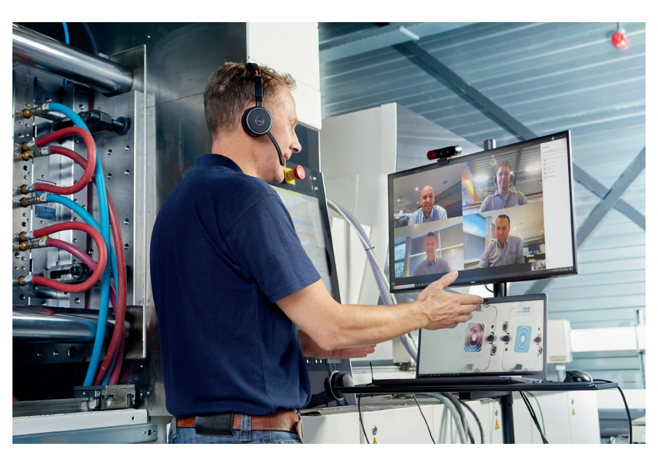
Figure 6: The IGS operator communicates through a headset.

In 2020, IGS GeboJagema introduced remote validation (Figure 5). Remote validation makes it possible for clients to join the IGS team in the workshop from wherever they are in the world through a