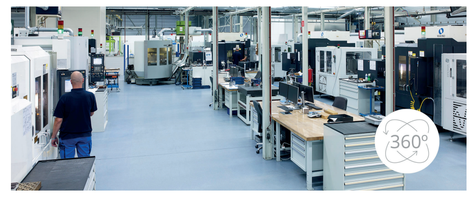
Figure 4: IGS GeboJagema provides factory tours through 360-degree images.

IGS GeboJagema has been working on several smart technical solutions to move these meetings online as well, whenever it is convenient for clients.