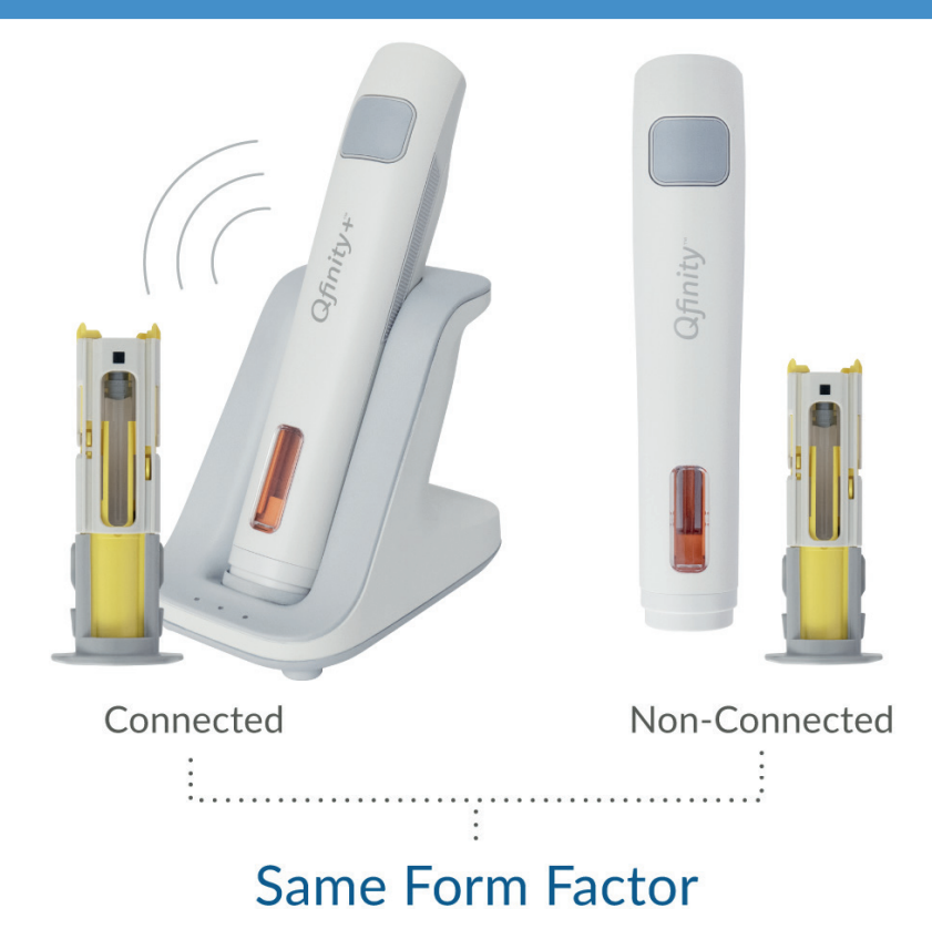
Figure 2: The Qfinity platform offers the market an autoinjector with an option for a connected version in the same form factor and with the same user operation steps.

Incorporating a connected autoinjector in clinical studies provides investigators with a valuable tool for capturing patient insights, enabling them to manage study participants more effectively to adhere to the protocol. When study investigators are freed up to focus their efforts primarily upon those study participants who – for