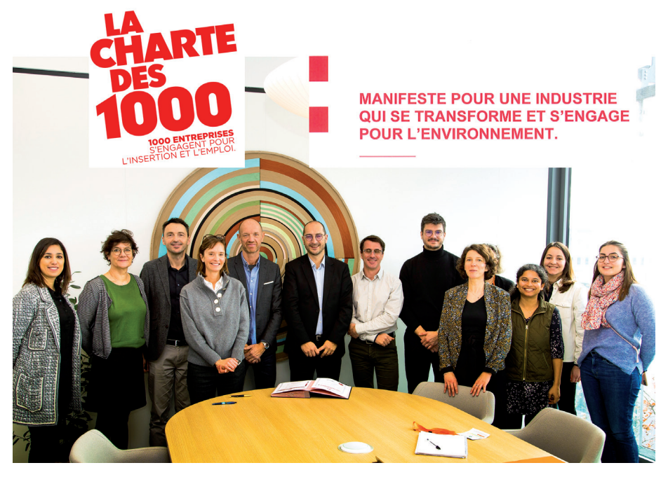
Figure 3: Commitment to local employment.

"The beneficial effects of its strategy will be amplified if the company can convince its suppliers, customers and financial partners to participate in its initiatives at their own level"