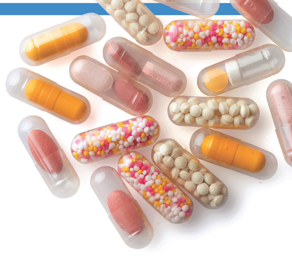
Figure 2: Solid-solid capsule combinations.

Incompatibility between pharmaceutical ingredients is a significant challenge encountered during the development of drug products. Reactive impurities produced by drug–drug interactions may cause product instability due to the production of toxic degradants, which can limit the scope of product development. Capsules provide a solution to this problem by allowing the delivery of multiple APIs without causing compatibility issues. By using a protective coating, the formulator