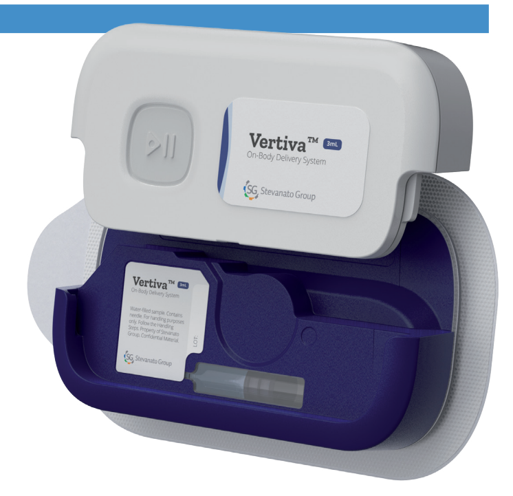
Figure 1: Vertiva™, Stevanato Group's next-generation OBDS.

autonomy over their own care can be highly beneficial, but it can also introduce greater potential for treatment regimens to be compromised by poor adherence. Furthermore, devices that place a high level of demand on the user in terms of priming and administration can elevate the risk of medicine self-administration errors, which are known to compromise patient safety and are of particular concern among older populations.<sup>2</sup>