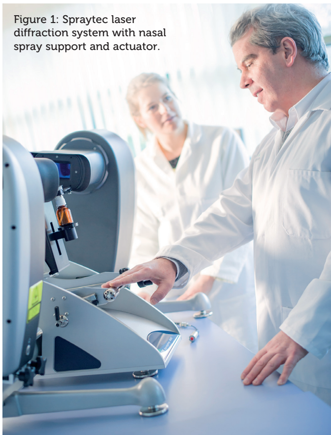
Figure 1: Spraytec laser diffraction system with nasal spray support and actuator.