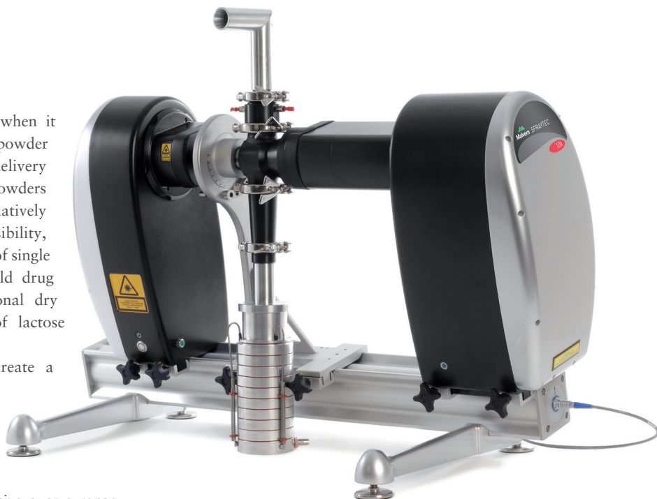
Figure 3: Spraytec laser diffraction system with inhalation cell.

Malvern Panalytical provides its partners and clients with global training, service and support, including local and remote support, under a full and flexible range of support agreements, which continuously drives their analytical processes at the highest