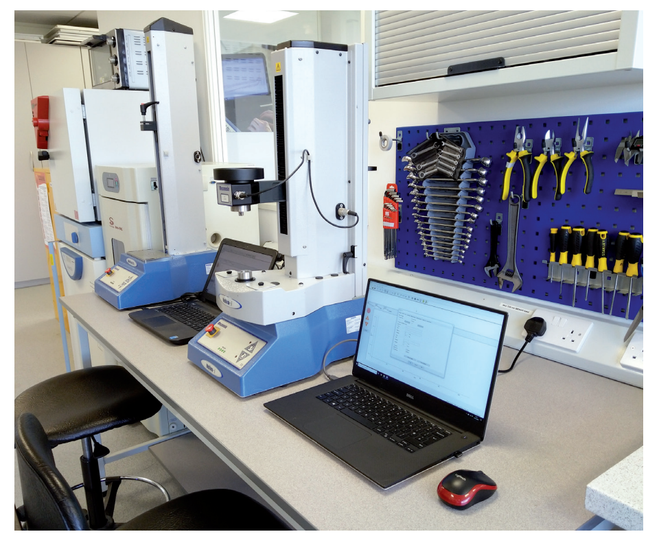
Figure 5: Mecmesin (Horsham, UK) force and torque testers.

Springboard is a technology and design consultancy, and forms Sanner Group's Design Centre of Excellence. Springboard creates and develops new products and technology, including products in the field of medtech and drug delivery devices, assisting companies in resolving technical challenges and decreasing time to market.