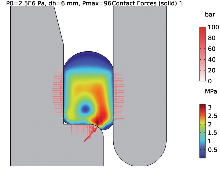
Figure 4: Pressurisation of the assembled O-ring from Figure 3.

also provides the ability to try a variety of dimensions across the tolerance ranges and map the contact pressures along the seal. This helps to build confidence that the design will be robust to sigma level six or "five nines".