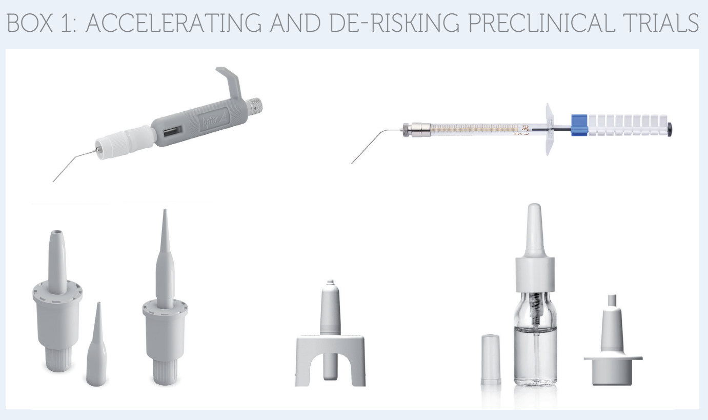
Figure 1: Aptar Pharma's devices suitable for animal dosing include the PADA and fine mist sprayer (top) for mice, the Unidose (UDS) liquid and powder paediatric (bottom left and middle) and the VP7-232NE paediatric, a multidose nasal spray (bottom right).

This intensifies the need for physiologically based pharmacokinetic