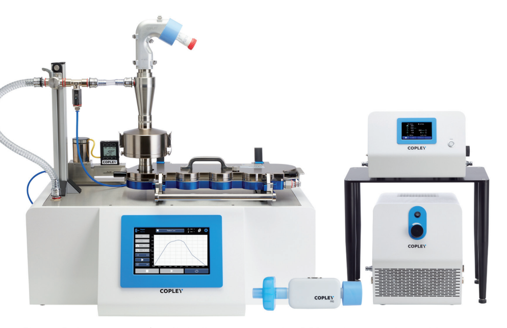
Figure 3: A test set-up for clinically representative DPI testing complete with breathing simulator, mixing inlet and AIT.

Interestingly, a comparable study of the performance of Breezhaler with a once-daily long-acting muscarinic antagonist (LAMA) glycopyrronium formulation indicated more robust performance with higher TED and FPD values and less variability across inhalation profiles representative of COPD patients.<sup>13</sup> Such results underline the formulation- and product-specific nature of flow-rate sensitivity and the corresponding need for testing.