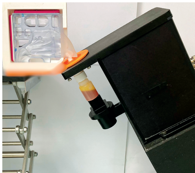
Figure 1. In vitro administration bench, double inclination base and automated actuation apparatus for intranasal device sensitivity studies.

“NEMERA HAS SHOWN THAT THE IMPACTION FORCE GENERATED BY GUIDED STREAM TECHNOLOGY IS SIMILAR TO THAT OF A COMMERCIAL PRESSURISED NASAL SALINE PRODUCT.”